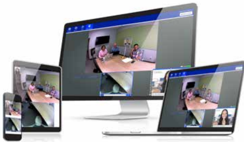
The Beam App

Save on travel costs. Realize better productivity and results.