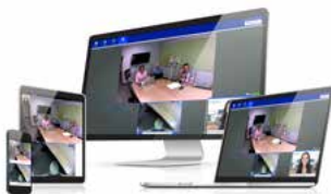
The Beam App

With natural mobility and immersive telepresence, BeamPro ® puts you in the room with the people who matter most.