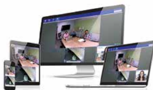
The Beam App

With natural mobility and immersive telepresence, Beam ® puts you in the room with the people who matter most.